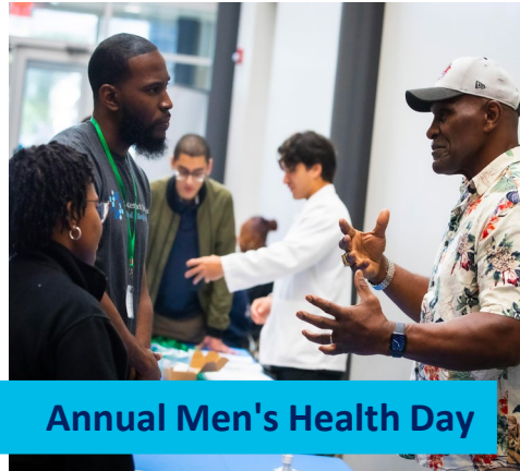
Annual Men's Health Day

We had >150 men and their family members attend with >15 different hospital/ community/ religious organizations participating.