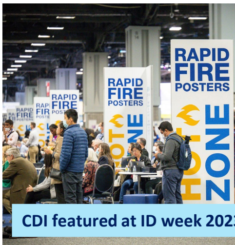
CDI featured at ID week 2023

The Center for Discovery and Innovation was honored to be featured at the ID Week held in Boston in October. Our work in diagnostics, therapeutics, and prevention took the spotlight, underlining our commitment to advancing the global battle against infectious diseases. Our contributions left an indelible mark on this prestigious event.